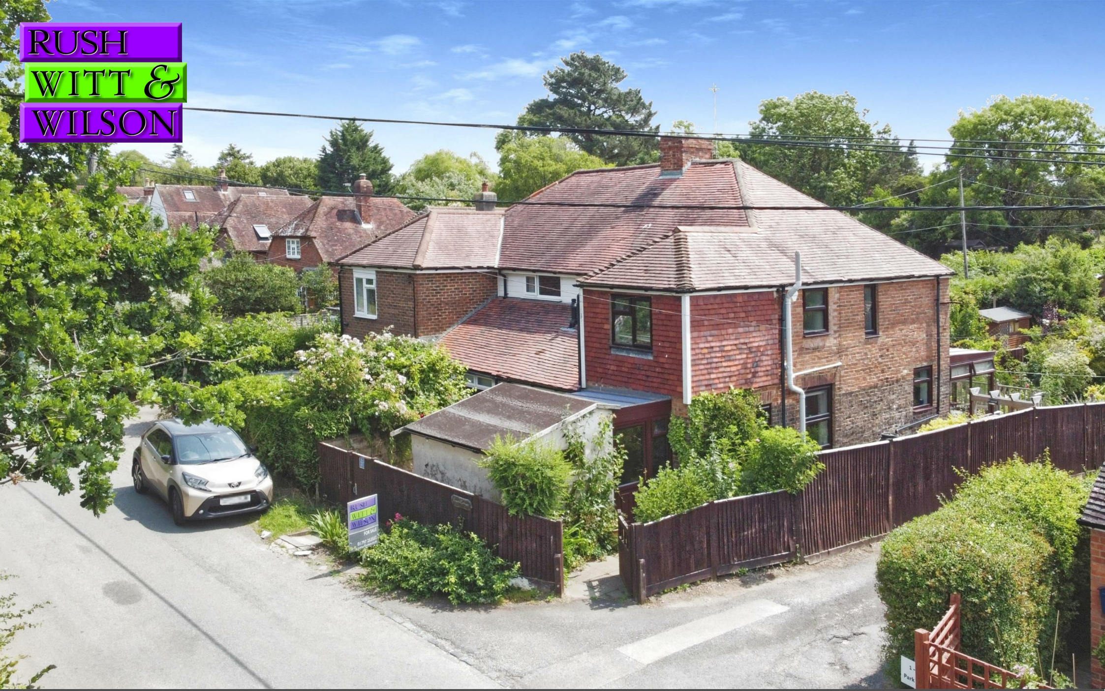
Craven Cottage, Ewhurst Lane, Northiam, East Sussex, TN31 6PA. £425,000 Freehold